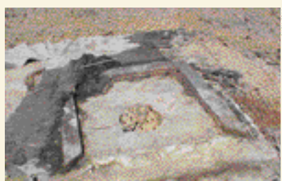
Photo 3. Redwood strips surrounding inlet/outlet structure at bottom of a pond.

tration and microorganisms on the PVC geomembranes. As mentioned previously, the pond was overgrown with vegetation, which prompted the excavation and pond re-lining. Each of the ponds had a large amount of cattails around the perimeter of the pond (Photo 1) and in the middle of the pond. As the bulldozer removed the soil from the top of the geomembrane under the cattail area, observations were made of the root zone of the cattails. These cattails produced one root stalk about 0.75 in. to 1.25 in. (1.9 cm to 3.17 cm) in diameter, with a mass of smaller roots around the main root. The root length was approximately 1 to 3 ft. (0.3 m to 0.9 m). All roots of the cattails grew down to the PVC geomembrane and then grew horizontally along the top surface of the geomembrane. No evidence of roots penetrating the 20-mil-thick geomembranes was found during field inspection or after holding the geomembrane over a light source.