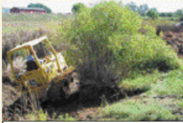
Photo 1. Willow tree and cattails being removed for geomembrane exhumation.

After three decades of performance, exhumed geomembrane retains strength and flexibility.